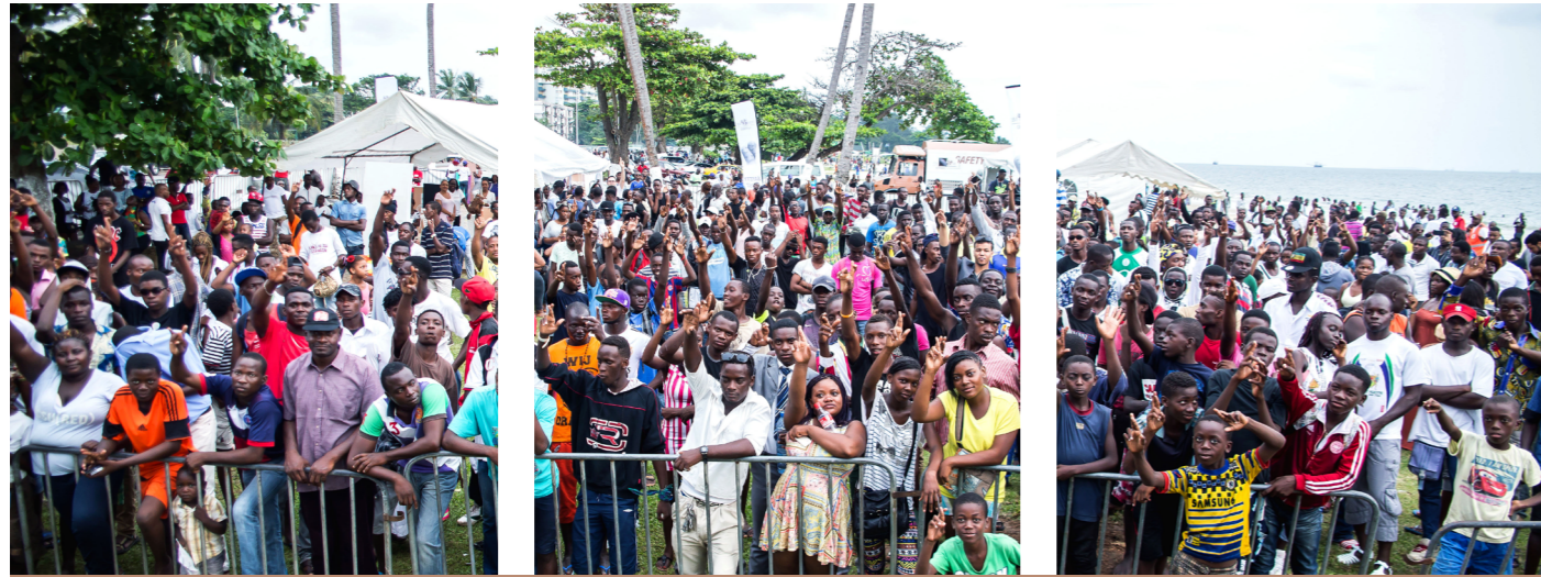
Libreville Safety First Camp.

Newsletter Foundation Sylvia Bongo Ondimba