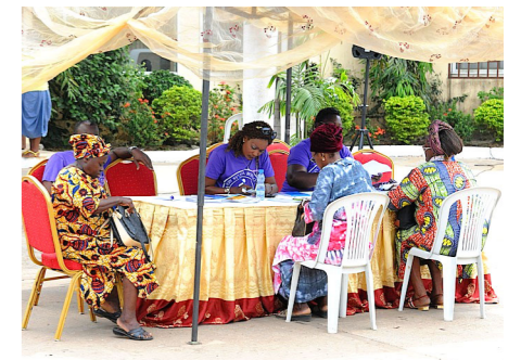
FSBO volunteers listening to widows.

Finally, the consolidation of a judicial arsenal enabling further protection of women and their families is an essential stage in the improvement of their condition: women must be able to rely on an adequate and simplified judicial apparatus with competent and motivated professionals. Such is the vision carried by the FSBO teams.