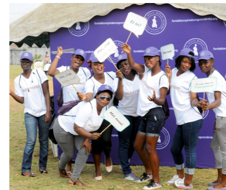
FSBO volunteers at Mitzic.

of AIDS (GDPS) engaged in the Safety First campaign with three objectives: to increase young people's knowledge on the HIV/AIDS virus and on ways to protect themselves against it; to raise awareness about the use of condoms, which to this day, remains the only possible way for them to protect themselves and their future, and to distribute free condoms during this campaign. To this end, FSBO has created its own exclusive line of condoms, "You and me by FSBO", according to a colour scheme which reflects each of its initiatives.