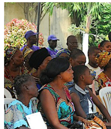
Juridic and administrative consultations during the International Widows Day, 2015.

Finally, the 5th anniversary of International Widows' Day was marked by legal and administrative consultations in 3 arrondissements of Libreville, in Owendo and in Akanda. The aim was to inform widows, their families and the public in general on the advances which characterise this cause close to FSBO's heart which since 2010 has been fighting for an improvement of the situation of widows in Gabon. Of course, we are far from having reached our objective. Mentalities need to be changed when it comes to widows and women in general, and these women will only obtain the respect they deserve if they ensure they are autonomous; but our country is on the right path, this decade will be the decade of women in Gabon... or nothing!