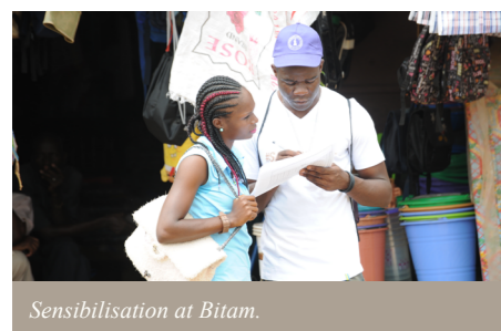
Sensibilisation at Bitam.

Yes, our pupils have worked extremely hard this term, and FSBO has assisted and supported them in their efforts. To preserve the health of our youth from the dangers they face through STDs and AIDS through information, reaching out into all neighbourhoods and homes... such is the aim of the Safety First Campaign. This campaign was deployed in Libreville as well as in the towns of Owendo, Akanda and across the province of Wolleu-Ntem. Openly and in a light-hearted manner, FS-