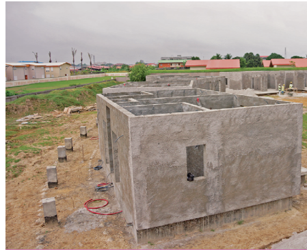
Global view of the site «La Maison de Vie».

Newsletter Foundation Sylvia Bongo Ondimba