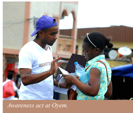
Awareness act at Oyem.

general population of our country had reached 4.1%: 41,000 people were living with the HIV virus in Gabon. Moreover, the Demographic Health Investigation (EDS) revealed that to this day, the use of contraceptives represents only 31%. Consequently, 28% of the young women aged 15 to 19 had already become mothers at the time of the investigation. These worrying statistics show that the young people do not sufficiently protect themselves and that in general, the use of condoms remains insufficient.