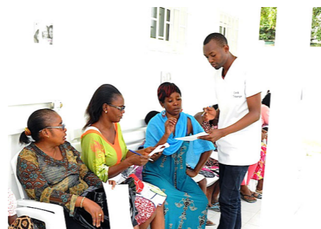
Awareness campaign for the early screening of female cancer at the Cap Esterias.

During the first 3 days, close to 2000 women ages 25 and over were made aware of the purpose of early screening and treatment of feminine cancers, by far the most frequent cancer in Gabon, and almost 100 women were examined. The last phase of the campaign was a clinical breast and cervical examination led by a reinforced team of gynaecologist, midwives and nurses. In order to support the vigilance of the women examined towards the problem of feminine cancers,