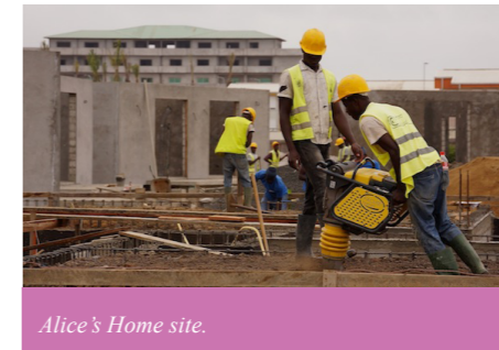
Alice's Home site.

It is estimated that work will complete during the second term of 2016. The major role it will play in supporting cancer patients and their families makes it a priority project for FSBO.