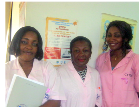
Midwives trained to the early screening of female cancers..

In view of optimising the chances of success of early screening feminine cancer actions in the 3 provinces targeted this year, FSBO has organised training sessions for healthcare providers: these took place from the 25th to the 27th of March at the University Hospital of Franceville (CHR) from the 14th to the 16th of April at the CHM in Oyem and from the 26th to the 28th of April at the CHR of Port-Gentile. For 3 days, 8 gynaecologists, 13 GPs, no fewer than 42 midwives or matrons and 19 nurses were thus able to familiarise themselves with the approach, the concepts and the techniques of early cancer screening. They were also able to touch upon the principles and organisational basis upon which the Breast and Cervical Cancer Early Screening program (DPCSC) is built.