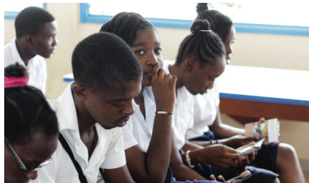
Young students of the Pepinière's program of Port-Gentil

As for the education of our children, we will not allow it to take a back seat. The Ozavino Incubator which is a recruitment pool for the prestigious Ozavino Scholarship will be "taking root" in Port-Gentil at the start of this year.