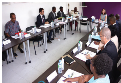
The scientific steering committee's headed by the President of the Foundation

On the 3rd of March, the SBOF for the Family was pleased to undertake its first deontological and scientific committee for cancers, within his premises. Run along by her President, this committee counted the greatest health experts of the country.