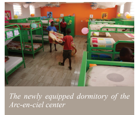
The newly equipped dormitory of the Arc-en-ciel center

The Foundation wishes not to leave out anyone by the side of the road to the harmonious and sustainable development of our country. Unattached youth, economically weak families and people living with reduced mobility find in the Foundation that little nudge they need to take off.