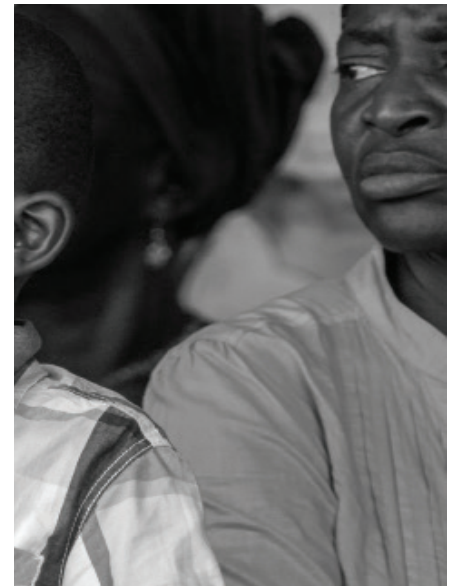
Awareness campaign against female cancer

Approximately one third of all cancers could be prevented and others can be cured if they are diagnosed and treated on time.