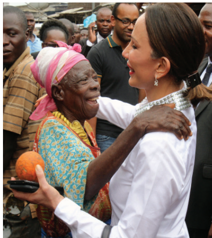
The President of the SBOF meeting with women of Franceville

The regional hospital in Franceville is equipped with an early detection unit as well as personnel trained to run it. It launched its screening activity during the 2015 « Pink October » campaign. It is also planned for the Port-Gentil unit to be equipped with a colposcopy to reinforce the early detection set-up already in place.