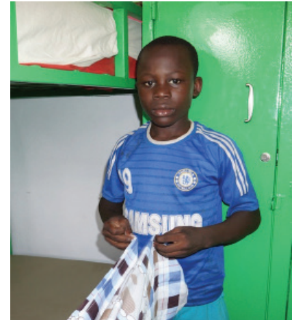
New dormitory for the young boarders of Arc-en-Ciel

Among the many actions of solidarity led by SBOF since it was created, an essential place is given to supporting young people who have either dropped out of the school system or are experiencing great social difficulties: this year, 34 young people will receive vocational training thanks to the SBOF Unqualified Youth Social Insertion Scheme.