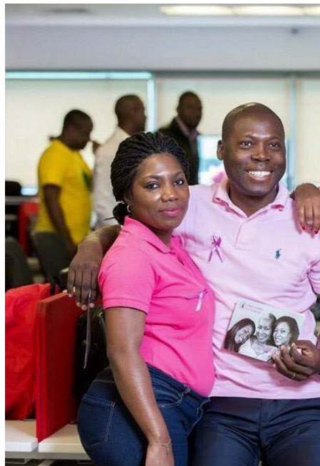
The Airtel team, mobilized for the the pink october campaign