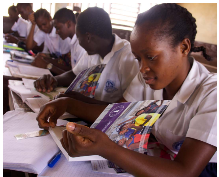
Students from the MODJECKOU College discover the Career Book

Faced with the great distress of having to witness massive failure among poorly-advised students, or students whose qualifications will not lead to employment, FSBO, through Striving for Success, offers a vast catalog of existing careers in order to inform school-leavers about jobs and training schemes which match employment opportunities in Gabon. Beyond its informative function, this book establishes the necessary link between the world of education and the world of employment. After Estuaire, Woleu-Ntem, Ogooué-Maritime and Moyen-Ogooué, the caravan made its way to the Province of Ngounié where it visited 11 schools, both public and private, dispensing either general or vocational education, and the library of Mouila. 612 copies of the careers handbook were distributed, taking the total number of books distributed to date to over 6,000. The handbook was very well received. The headmasters particularly appreciated the FSBO initiative of coming into direct contact with the teaching staff in order to involve them closely with the project, in full recognition of their role: to help the students use the handbook in an optimal and efficient manner. In due course, the project should spread to the entire country and be enriched with new tools.