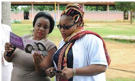
Women getting aware of the the early screenings about feminine cancers

Newsletter Sylvia Bongo Ondimba Foundation