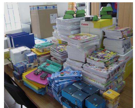
School equipment for the prison

Currently, this school which is a second chance for the teenagers is divided into two classrooms and one meeting room which were entirely refurbished by the SBO Foundation for the Family.