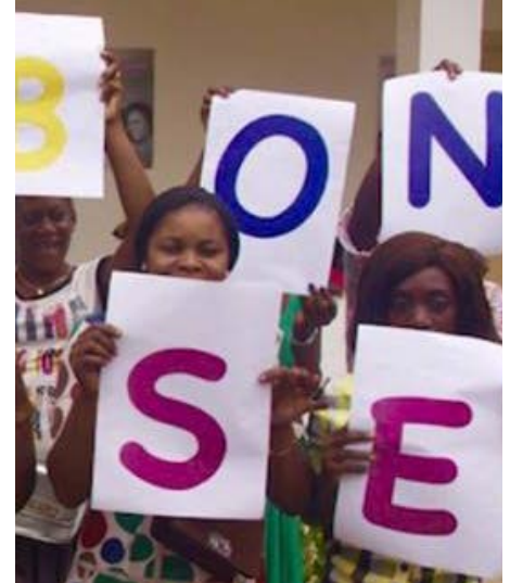
Women of Port-Gentil displaying the #gabonrose (#forapinkgabon)

F or the second year in a row in Gabon, and as part of its "Action against Cancer Programme", the SBO Foundation for the Family would like to develop and strengthen the concept of 'Pink October' with the collaboration of the Ministry of Health. But what does 'Pink October' mean? For the last 22 years, it has been the month of a worldwide drive for increasing awareness of feminine cancers. For the duration of this 'pink' month, events are organised in order to make people understand, talk about and mobilise against cancer. This year, the main objective of the FSBO through this fight which is so close to its heart, is to bring awareness to our people of the importance of early screening of breast and cervical cancers. It was also important for the FSBO to support healthcare workers in advising and caring for their patients. From 9th October to 13th November this year, an information and awareness campaign was rolled out first across the Province of Estuaire, and then across 3 new health regions: Ogooué-Maritime, Haut-Ogooué and Woleu-Ntem.