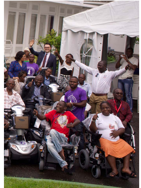
Beneficiaries of the Handicap Workshop

W ithin the scope of its Initiatives for Solidarity, SFBO launched the Solidarity Handicap project from the time the Foundation was founded. In order to contribute to the social integration of those made vulnerable through motor disability, FSBO delivers mobility equipment in the shape of manual and electric wheelchairs, junior wheelchairs, scooters and walking frames. Between 2011 and 2015, 767 different pieces of equipment were distributed across the entire territory of Gabon. In order to ensure that this project continues, a maintenance and repair workshop for rolling equipment was set up in Libreville as early as 2010 and a number of maintenance missions were conducted across different country locations inland.