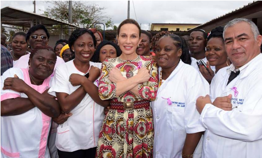
The FSBO's founder surrounded with the medical team of Gamba